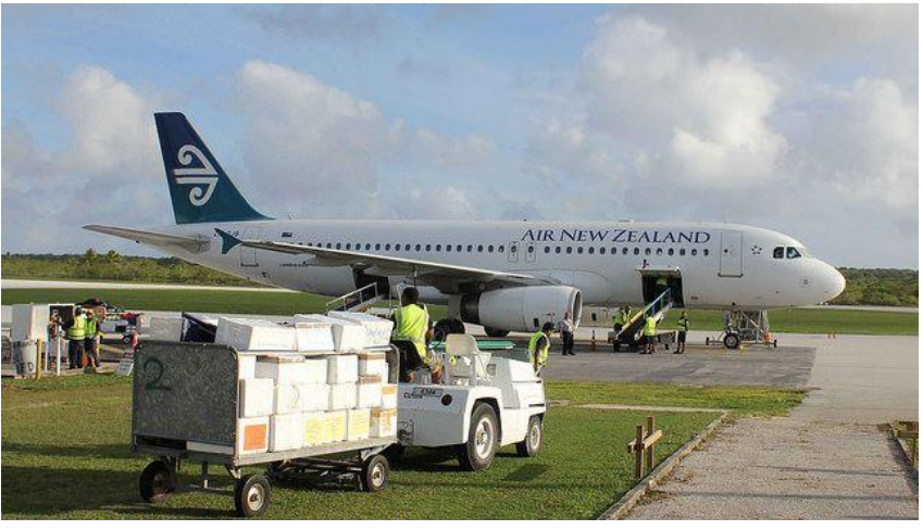
Hannan International Airport