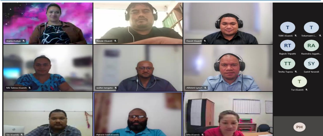
National Project Teams of the Cook Islands, Kiribati, Tonga and Tuvalu in an online virtual MS Teams ASYCUDA World Functional Training