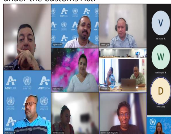
Above: NPT's with ASYCUDA experts undertaking online training on Declarations.

A number of other declarations will be available to cover other activities allowed under the Customs Act.