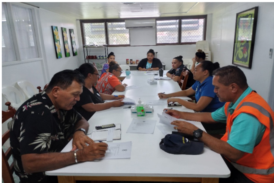
Participants of the CCA stakeholders meeting held on 29th June 2021.

As part of the meeting the NPT took the opportunity to also provide an update on the ASYCUDA project, and in particular to advise these five stakeholders what will be