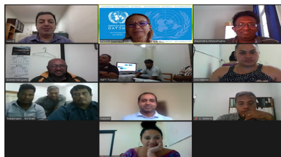
Participants from the Cook Islands, Kiribati, Tuvalu along with ASYCUDA and customs experts in a combined Microsoft Team training session.